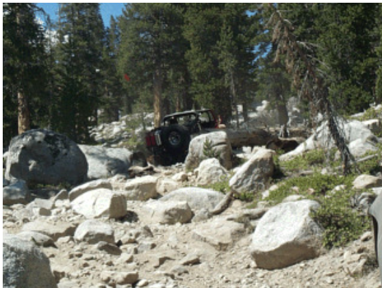
Rocks cover most of the trail

Trail Boss: Ron Webber ronjp@outlook.com Home 714 649 9836 / Cell 714 715 5692