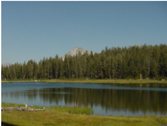
Beautiful High Sierra Lakes